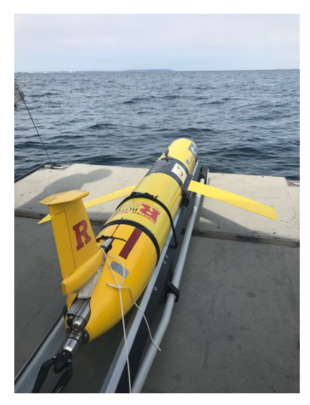
Deployment out of Sandy Hook, NJ, USA (above & below)

The seasonal glider deployments also flew through Atlantic sea scallop ( Placopecten magellanicus ) and Atlantic surfclam ( Spisula solidissima ) fishery grounds, providing a look at the carbonate system dynamics these species experience throughout a year. The data from these deployments is currently being integrated into laboratory and modeling experiments to investigate the effects of seasonal carbonate dynamics on larval shellfish success.