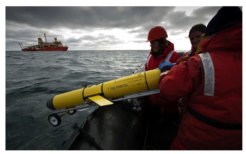
Fig. 2 A Webb underwater glider being deployed in the Ross Sea Antarctica in February 2011.

with wings to convert vertical motion to horizontal motion, and thereby propel itself forward with very low-power consumption.<sup>[14]</sup> Gliders follow a saw-tooth path through the water, providing data on large temporal and spatial scales. They navigate with the help of periodic surfacing for Global Positioning System (GPS) fixes, pressure sensors, tilt sensors, and magnetic compasses. Using buoyancy-based propulsion, gliders have a significant range and duration, with missions lasting up to a year and covering over 3500 km of range.<sup>[15-17]</sup>