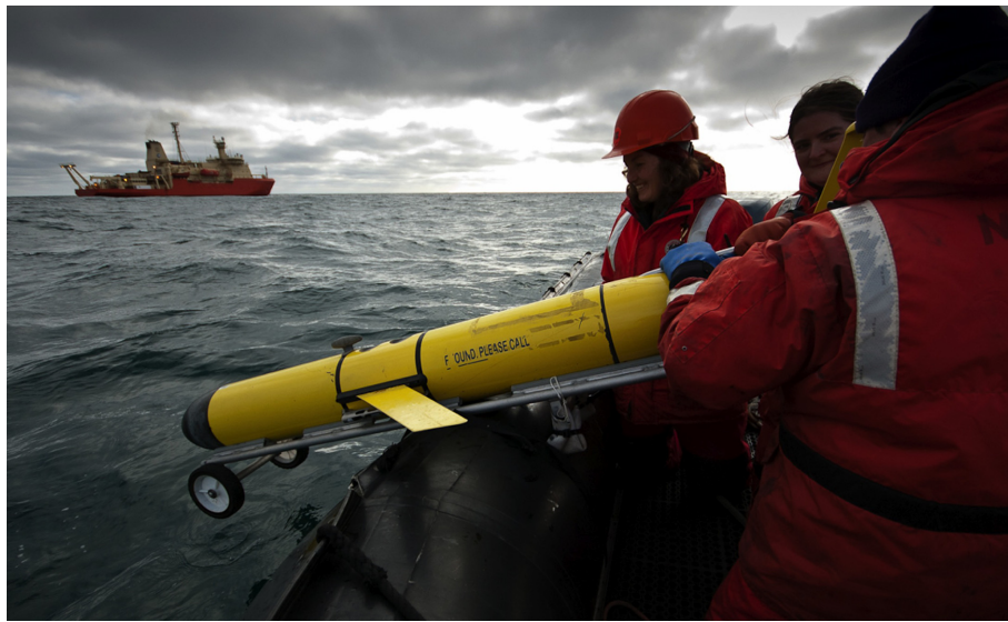
Fig. 2 A Webb underwater glider being deployed in the Ross Sea Antarctica in February 2011.

with wings to convert vertical motion to horizontal motion, and thereby propel itself forward with very low-power consumption. [14] Gliders follow a saw-tooth path through the water, providing data on large temporal and spatial scales. They navigate with the help of periodic surfacing for Global Positioning System (GPS) fixes, pressure sensors, tilt sensors, and magnetic compasses. Using buoyancy-based propulsion, gliders have a significant range and duration, with missions lasting up to a year and covering over 3500 km of range. [15–17]