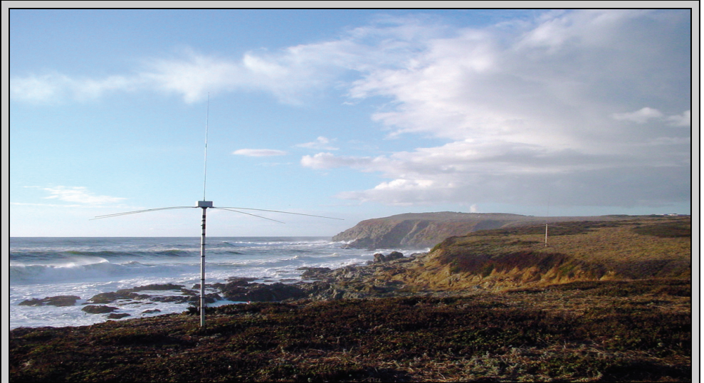
This photo represents one type of High Frequency Radar.

Sensor verification and validation is key to IOOS success. Recognizing this, NOAA IOOS supports The Alliance for Coastal Technologies